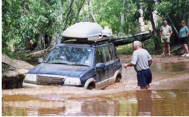
Crossing Ducie River on the Old Telegraph Track