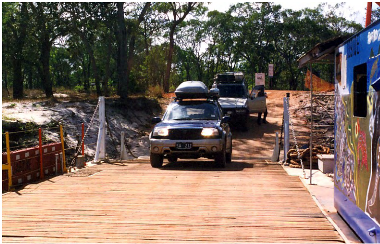
The Jardine River ferry