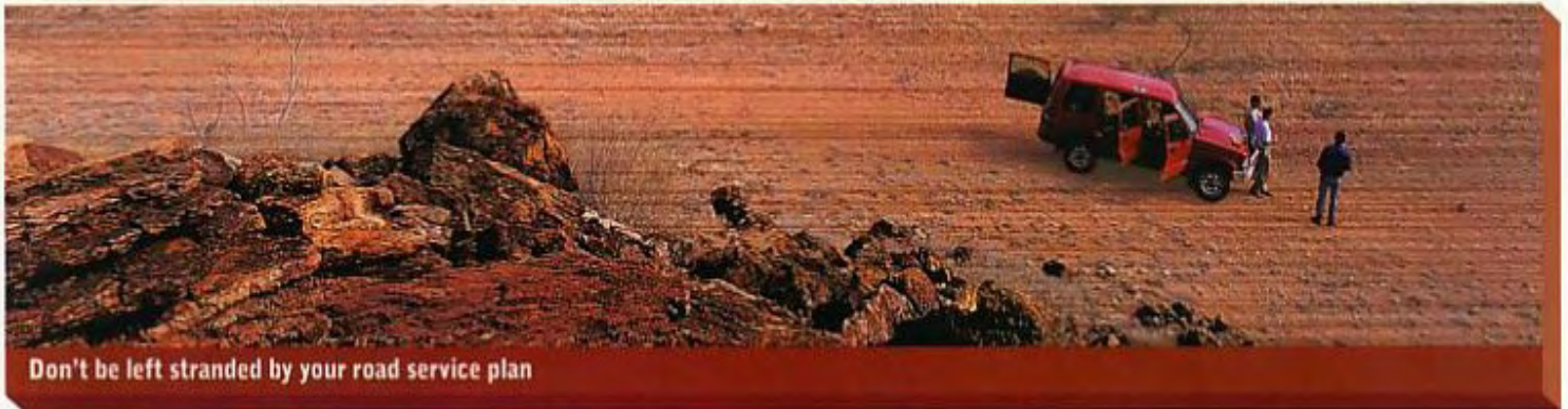
Don't be left stranded by your road service plan

Do not assume your 4X4 will gain similar benefits from road service plans or comprehensive vehicle insurance policies as two-wheel drives. Before paying extra cash for "Plus" plans check the fine print in the conditions of service for location, distance, cost and weight limitations. The holiday you are planning may place you