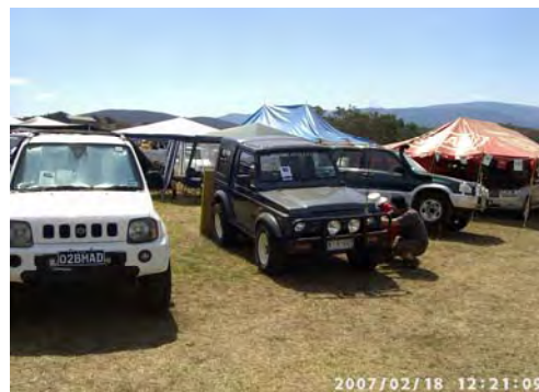
Some "Real" Forbys