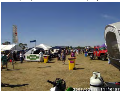
Hot day—but quite a few people and lots of displays