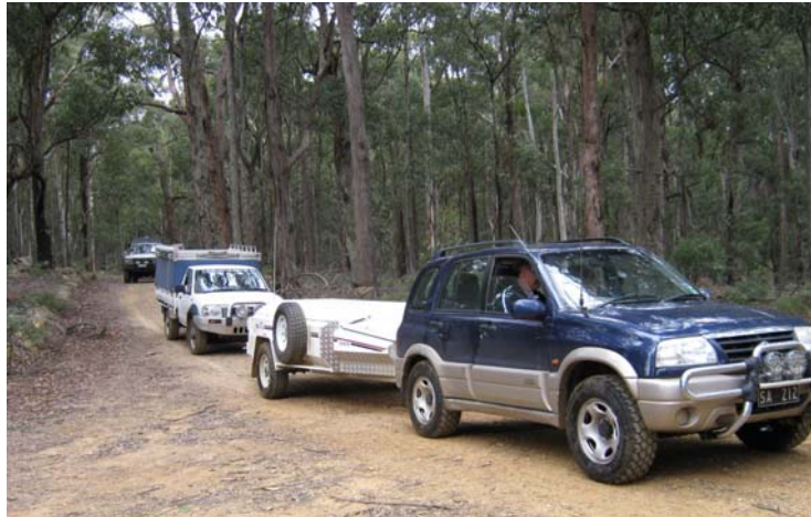
Time to go home